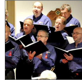
Sunday, May 20 3 p.m. Illuminati A Sacred Ensemble of the Columbus Gay Men's Chorus